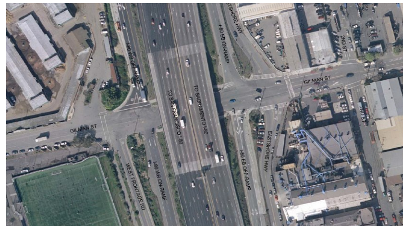
Aerial view of project location