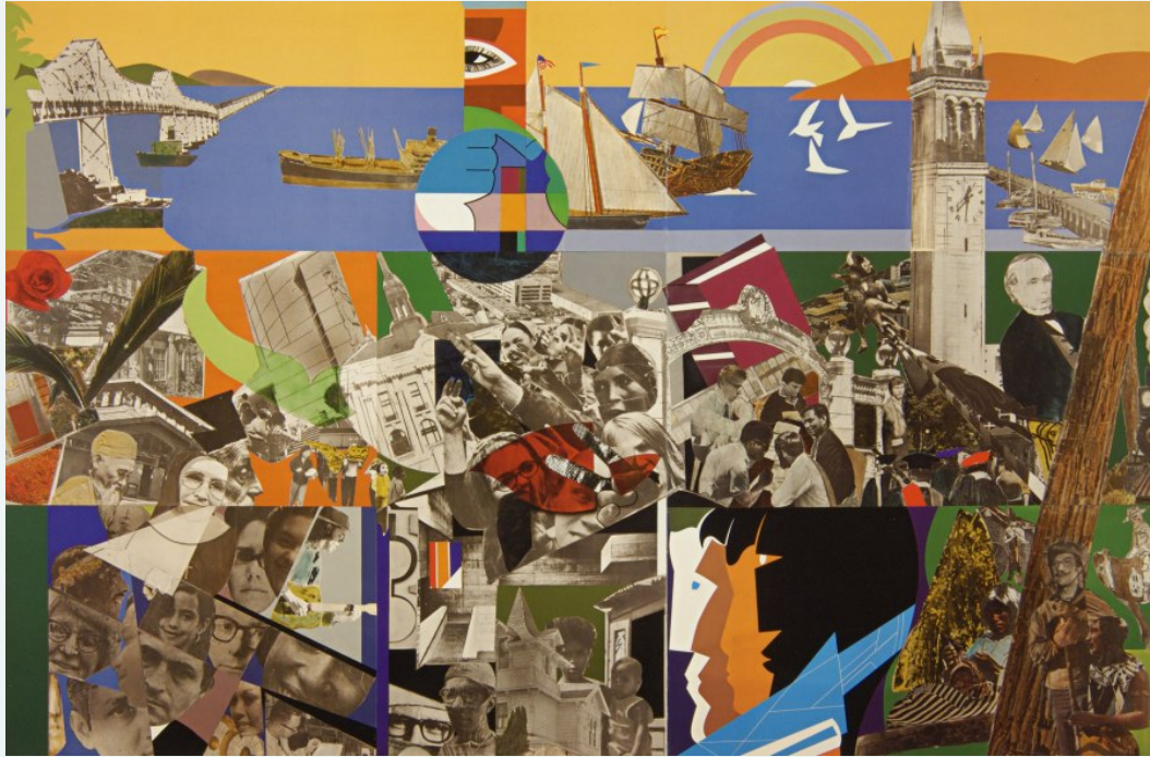
Mural (Romare Bearden)